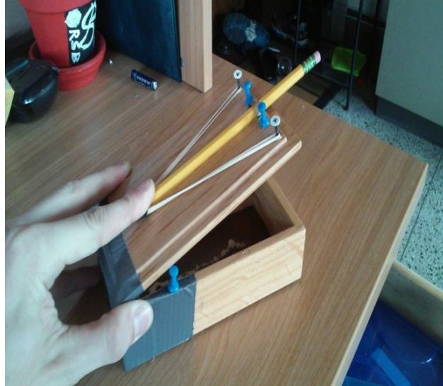
Figure 1: Not a ping pong ball launcher.