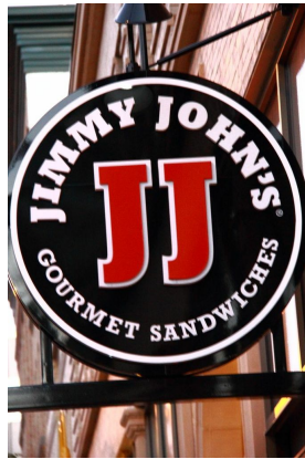
Figure 1: Example sign for Jimmy John's

The handling and design of many objects in everyday life rely on the center of gravity. For example, holding a heavy stack of books is usually much easier when the books are closer to your body, and thus closer to your center of gravity. This applies things that may appear simple at first, such as restaurant signs that need to hang without breaking or falling as shown in Figure 1.