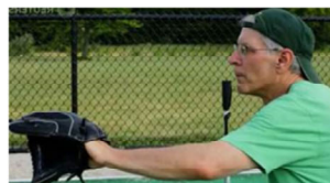
The ball is caught by the catcher.

Editorial advice from the ACS: “Use the passive voice when the doer of the action is unknown or not important.”