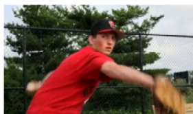
The pitcher throws the ball.

Passive voice: the subject of the sentence receives the action of the verb—the subject is acted upon