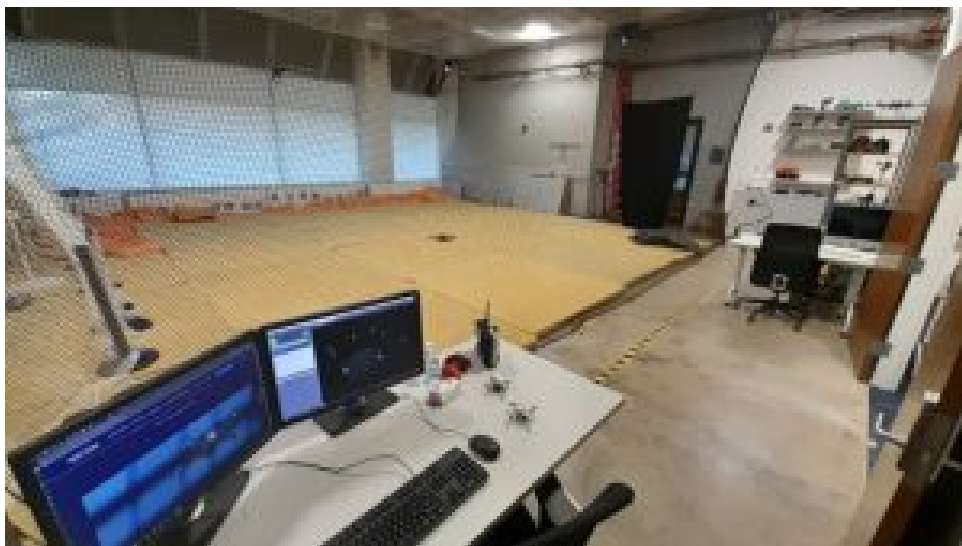
Figure 3: The University of Illinois Robotics Lab Flight Arena

Environmental factors such as wind, rain, and temperature extremes can affect the drone's performance and reliability. The drone therefore will be designed to be used indoors within a proper flight arena to remove these risks.