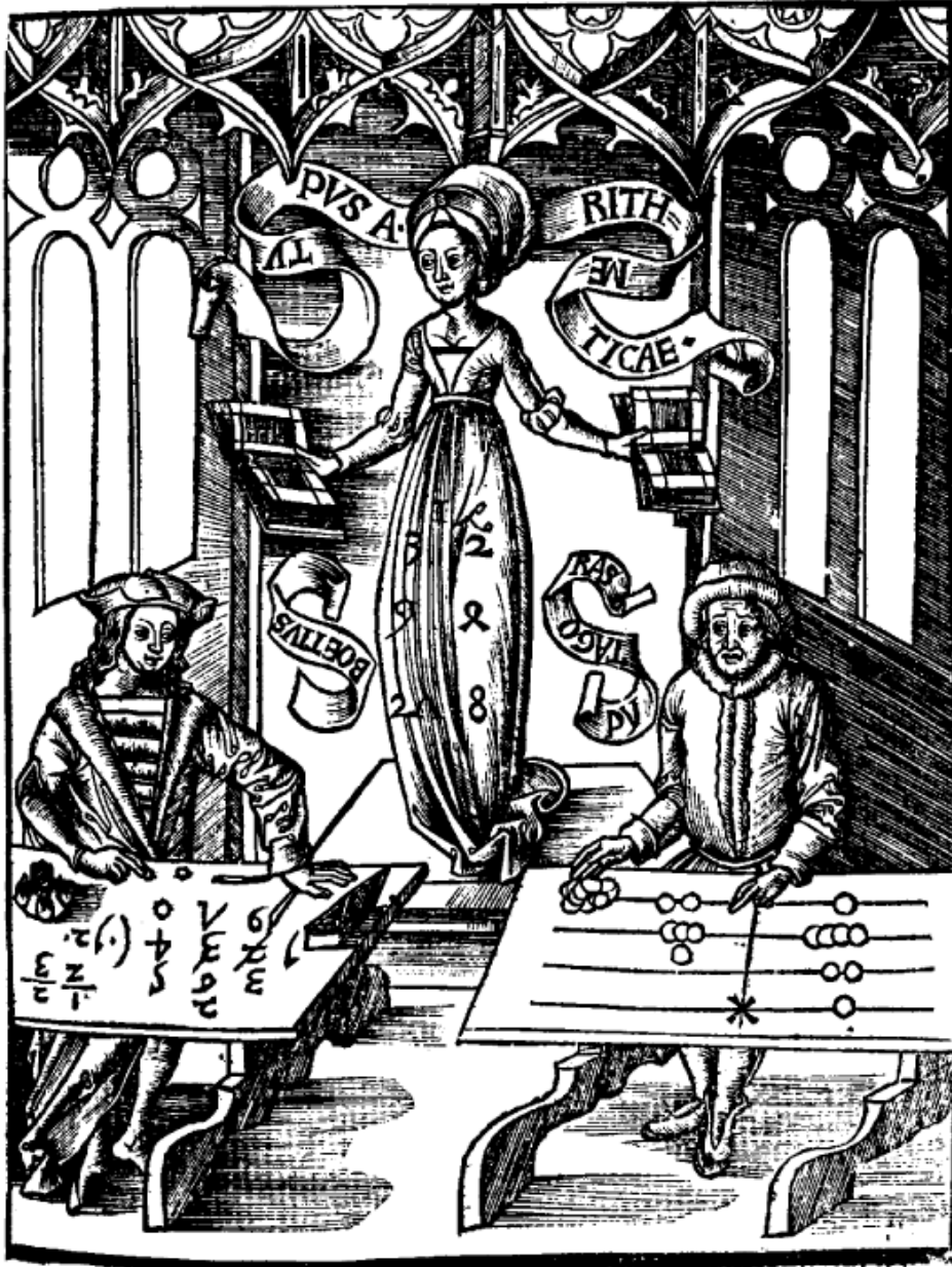
Boethius the algorist versus Pythagoras the abacist. from Margarita Philosophica by Gregor Reisch (1503)