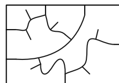
No more moves.

Analyze this game, answering the following questions (and any more that you determine the answers to): When is it better to play first, and when it is better to play second? Is there always a winning strategy? What is the smallest number of moves in which you can defeat your opponent? Prove your answers are correct.