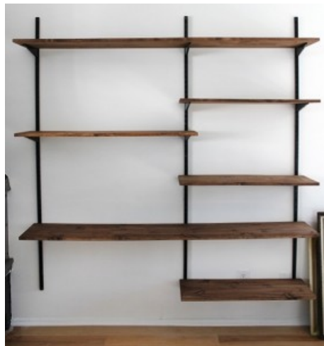
Figure 1: Shelves