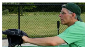
The ball is caught by the catcher.

Editorial advice from the ACS: “Use the passive voice when the doer of the action is unknown or not important.”