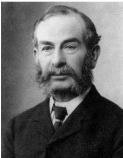
Edward John Routh, 1831–1907