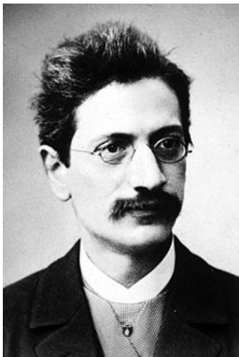
Adolf Hurwitz, 1859–1919