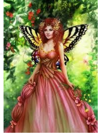
The Primitive Recursion Fairy

# let rec fold_right f list b = match list with [] -> b | (x :: xs) -> f x (fold_right f xs b);; val fold_right : ('a -> 'b -> 'b) -> 'a list -> 'b -> 'b = <fun> # fold_right (fun s -> fun () -> print_string s) ["hi"; "there"] ();; therehi- : unit = ()