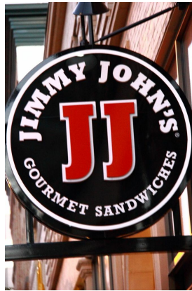
Figure 1: Example sign for Jimmy John's

The handling and design of many objects in everyday life rely on the center of gravity. For example, holding a heavy stack of books is usually much easier when the books are closer to your body, and thus closer to your center of gravity. This applies things that may appear simple at first, such as restaurant signs that need to hang without breaking or falling as shown in Figure 1.